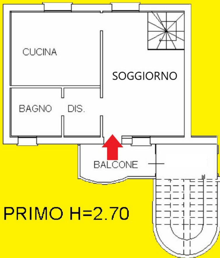
PIANO PRIMO H=2.70